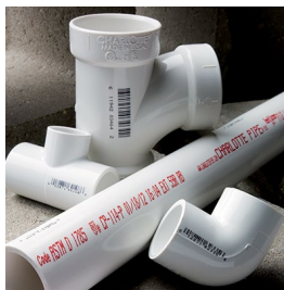
Continuous inkjet codes

Videojet coding solutions are designed to help manufacturers print the highest quality codes while maximizing efficiency and minimizing unexpected downtime.