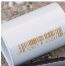
Laser code (color change)

Printed codes and marks are often the most visible indicator of your brand values and product quality. The legibility and appearance of logos, production and time stamps, bar codes and other marks can all contribute to perceived quality.